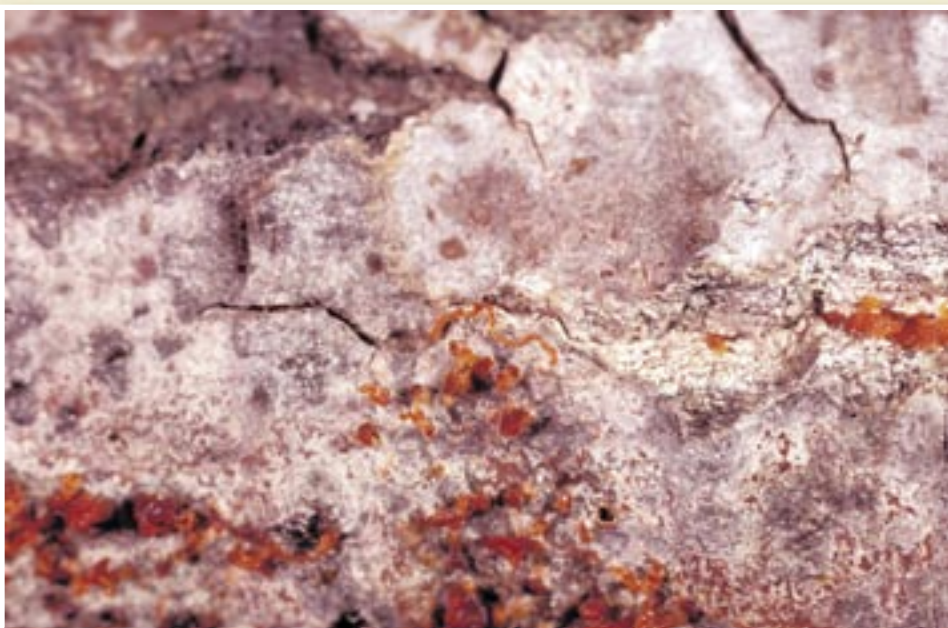
(below) Thyronectria canker of honeylocust.