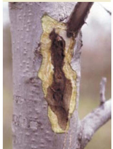
Discolored inner bark associated with branch and trunk cankers.

Cankers initially are elliptical, slightly depressed and reddish-orange. Sapwood just beneath the canker is also stained red. A reddish brown liquid may drip from the canker and stain the outer bark. With time, dead outer bark bleaches light tan, develops cracks, and