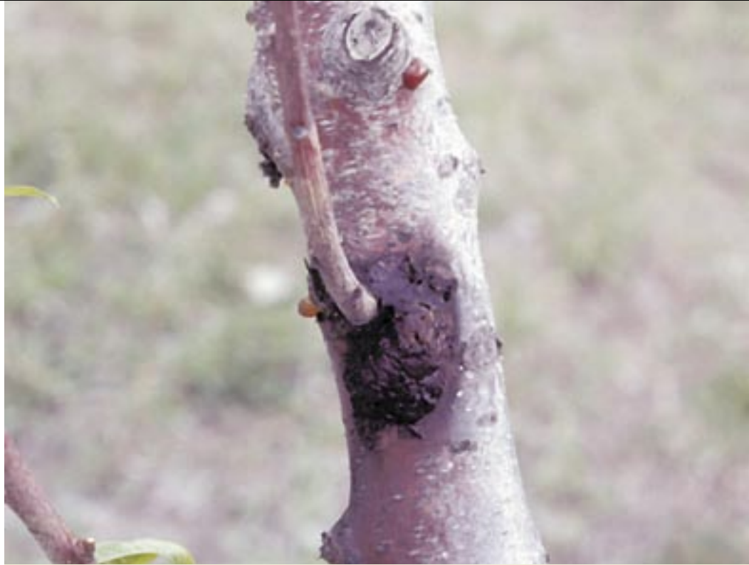
Perennial canker of peach. Note gummy resin leaking from canker.

B. stevensii causes elongated, flattened, often resinous cankers on Rocky Mountain juniper ( J. scopulorum ), savin juniper ( J. sabina ), and occasionally eastern redcedar ( J. virginiana ). Cankers can occur