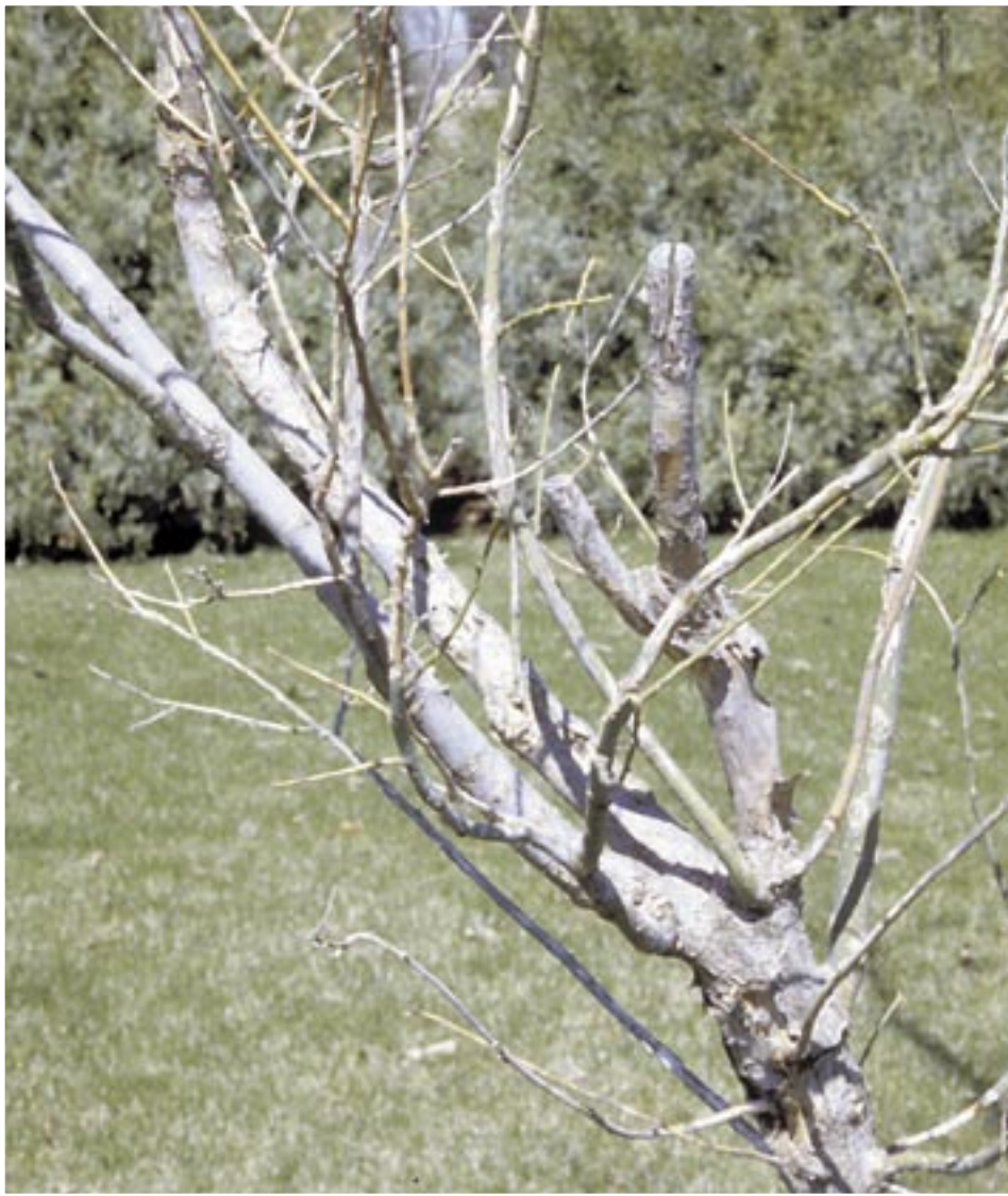
(left) Branch dieback of goldenrain tree associated with winter injury and Nectria cankers.