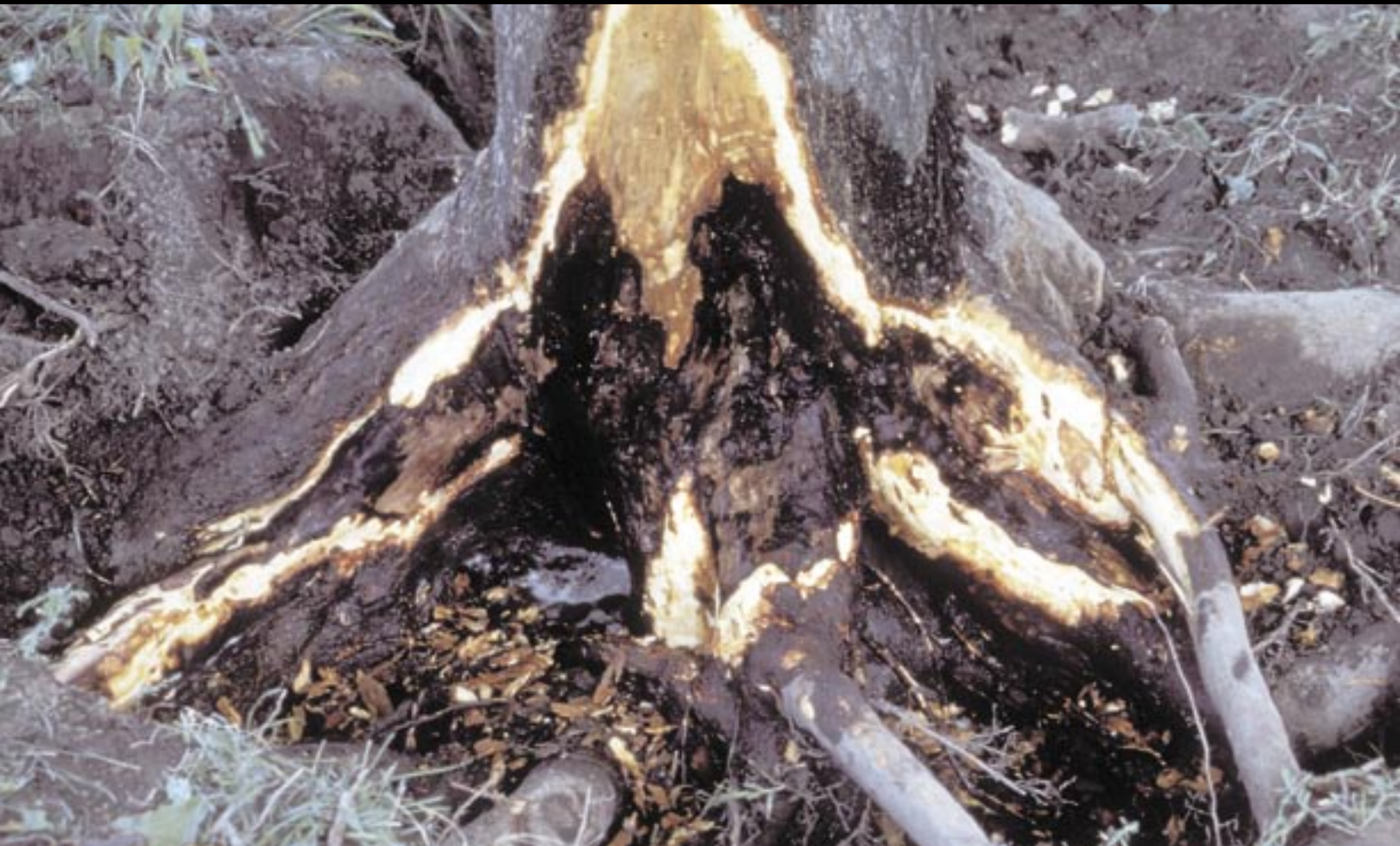
Some cankers may develop at the base of the trunk.

C ankers are localized dead areas of bark in trees and shrubs caused by fungi and bacterial infection. Canker pathogens can cause annual branch and twig dieback, disfiguring perennial stem cankers, or large, diffuse trunk cankers capable of killing trees in a short time. Canker pathogens cause some of the most destructive tree diseases, including chestnut blight, butternut (white walnut) canker, and dogwood anthracnose.