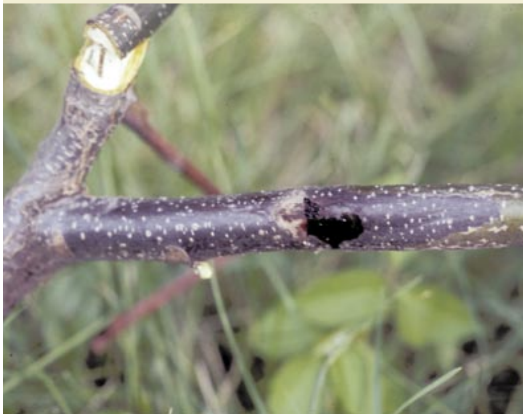
Twig canker developing after infection of leaf scar. Note the black discoloration of diseased bark.

The fungi Leucostoma and Valsa cause canker diseases on species including maples ( Acer spp.), plums and peach ( Prunus spp.), poplar and cottonwood ( Populus spp.), willow ( Salix spp.) elm ( Ulmus spp.), and spruce ( Picea