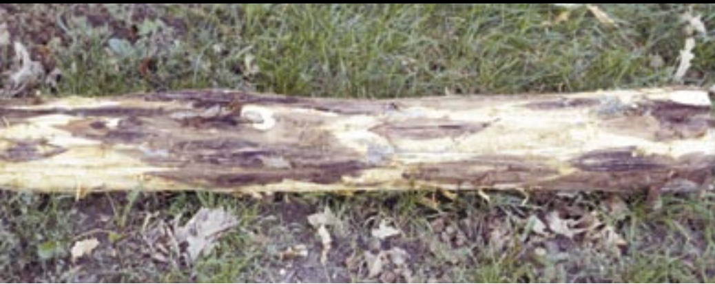
Bark has been removed from this trunk to show multiple, diffuse cankers.

spp.). Diseases caused by these fungi are also called Cytospora cankers ( Cytospora refers to the Latin name of the asexual stages of these fungi). Cytospora cankers usually are found on trees that have been damaged by cold temperatures or drought.